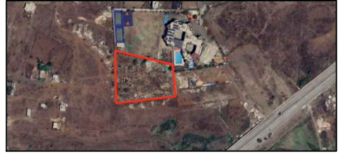
GOOGLE LOCATION PLAN SCALE - N.T.S.